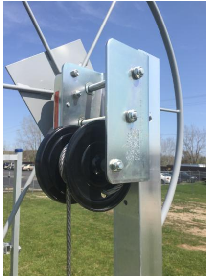
2500# Lift Winch

Bolt on the winch with 2 - \frac{1}{2} " x 4" Hex HD with \frac{1}{2} " Brass nuts and S.S. lockwasher.